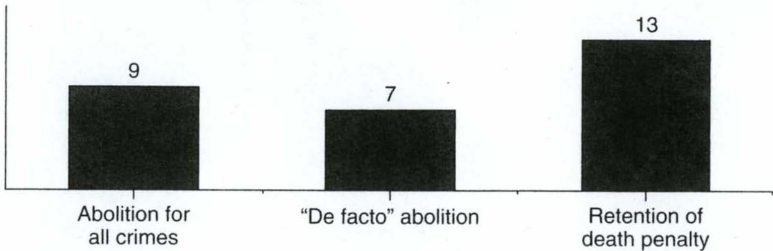
Fig.1: Status of the death penalty in 29 Asian jurisdictions as of January 2008.

Source: Johnson, D.T. & Zimring, F.E., The Next Frontier (Oxford University Press, New York: 2009) 16.